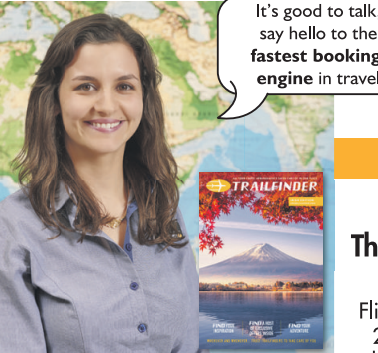
Call to talk through your plans and order your NEW TRAILFINDER agazine filled with offers